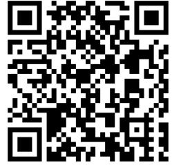
Scan the QR code to view the property online